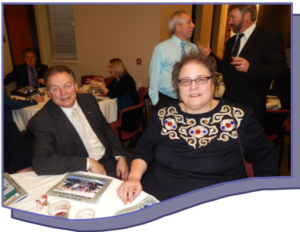
St. Francis Civic Center Gala Celebration December 04, 2014